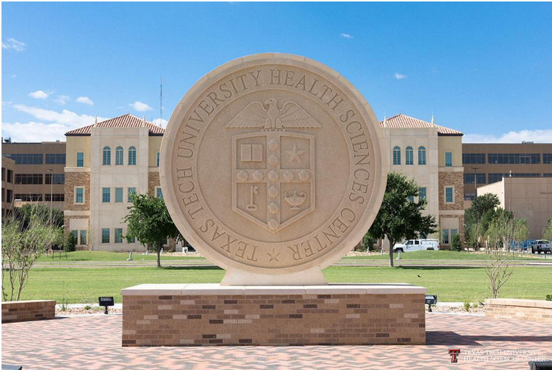
TTUHSC Seal at Main Entrance